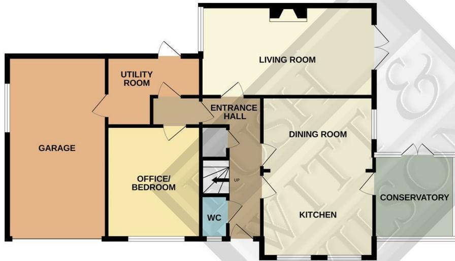
GROUND FLOOR 1025 sq.ft. (95.3 sq.m.) approx.