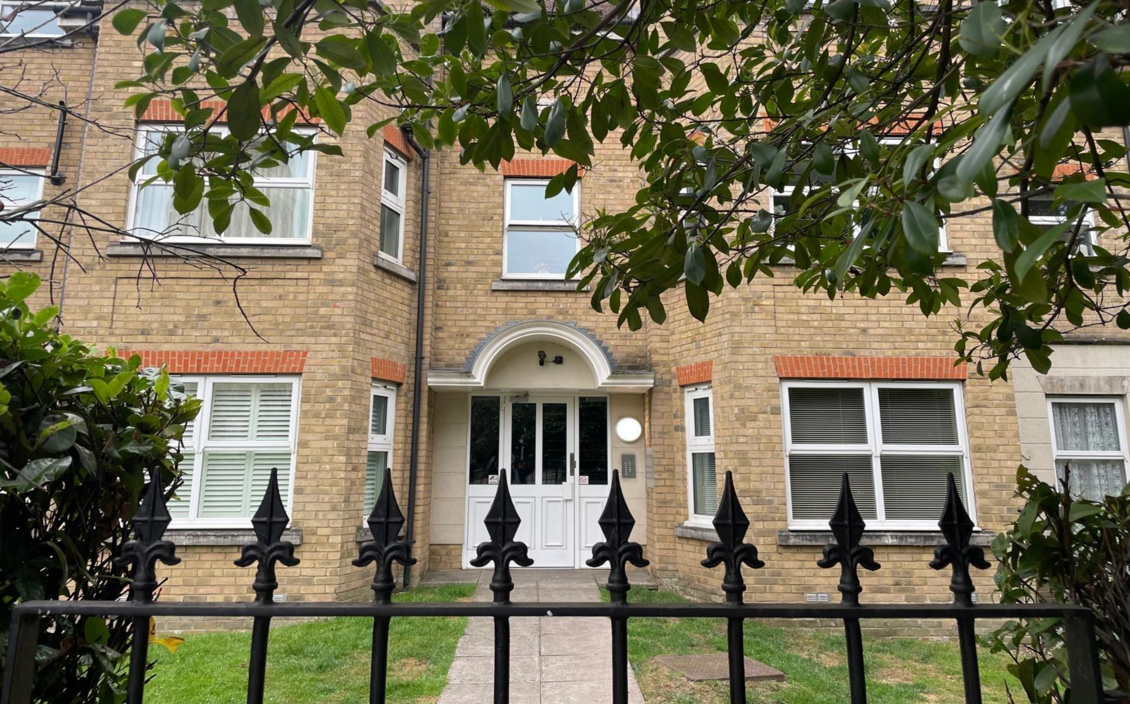
Salmons Brook House, Windmill Hill, Enfield, EN2 7AZ