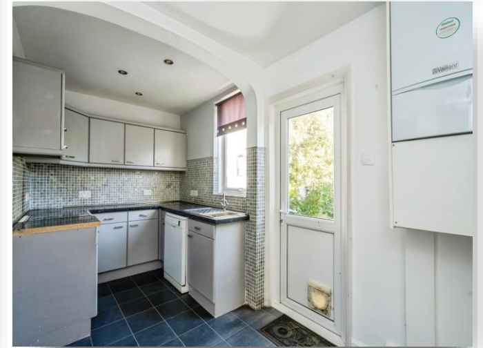
Chalcraft Lane, Bognor Regis PO21 5UA