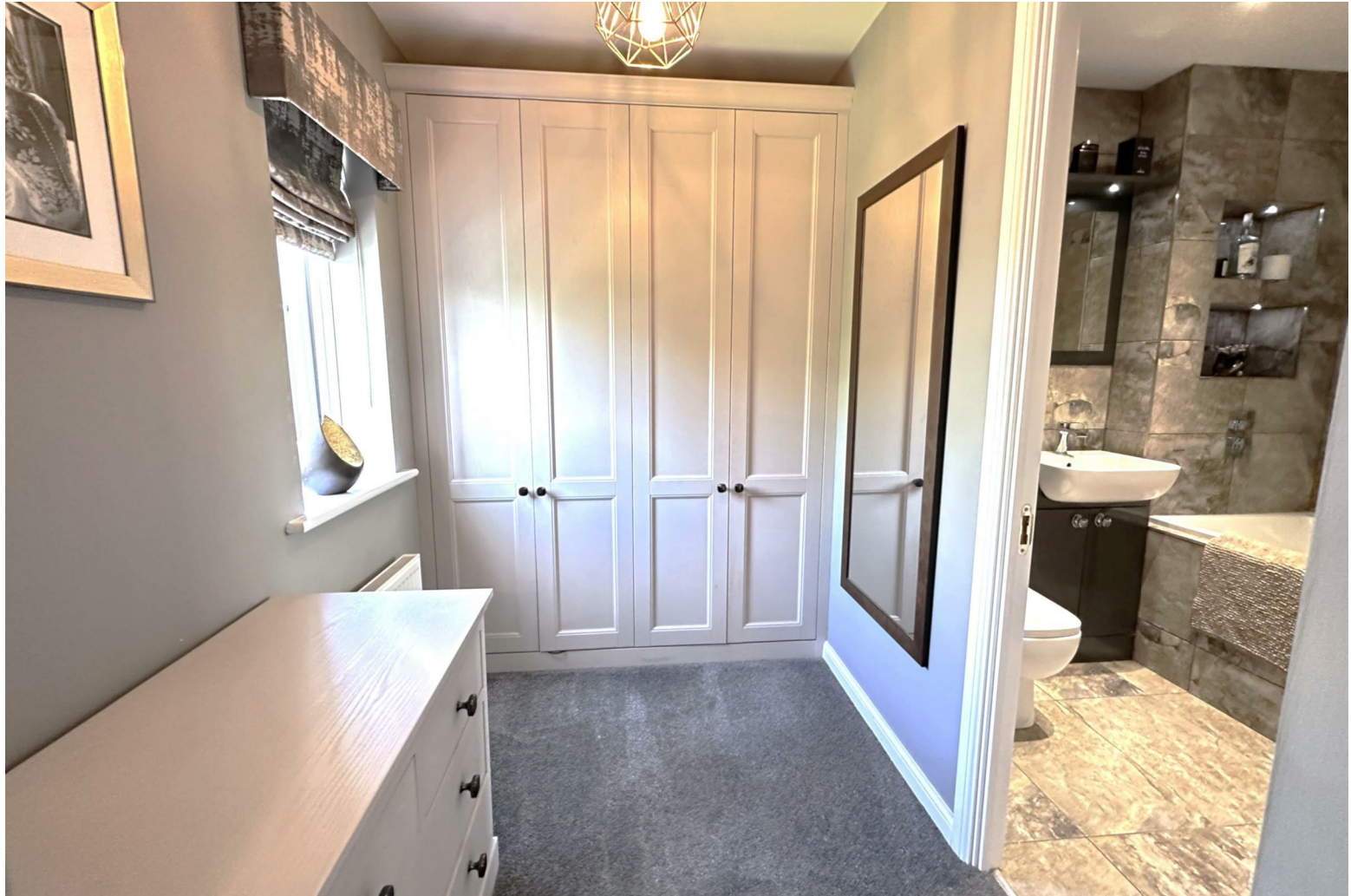
Black Bull Wynd, Aislaby, Eaglescliffe, TS16 0GN