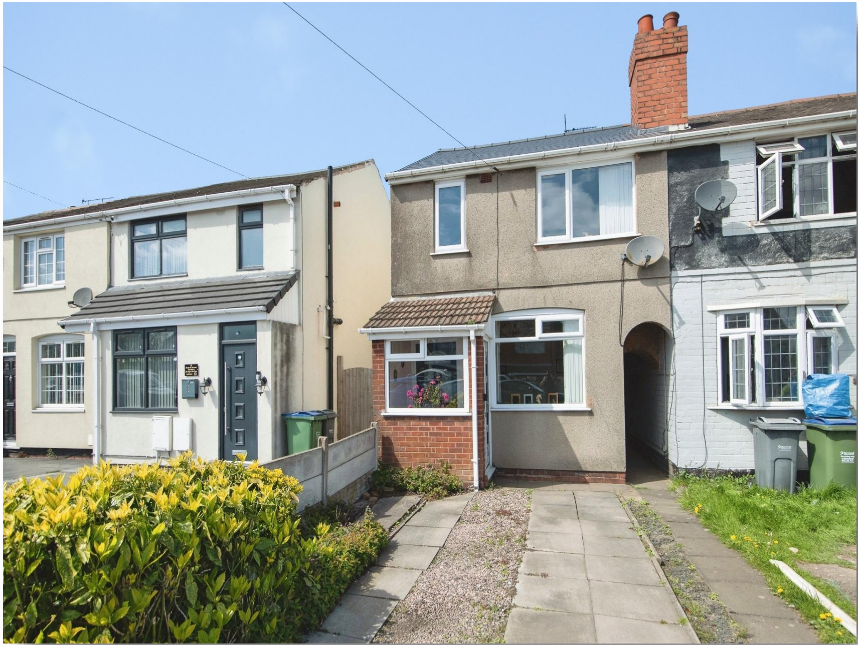
Newbury Lane, Tividale OLDBURY B69 1HE