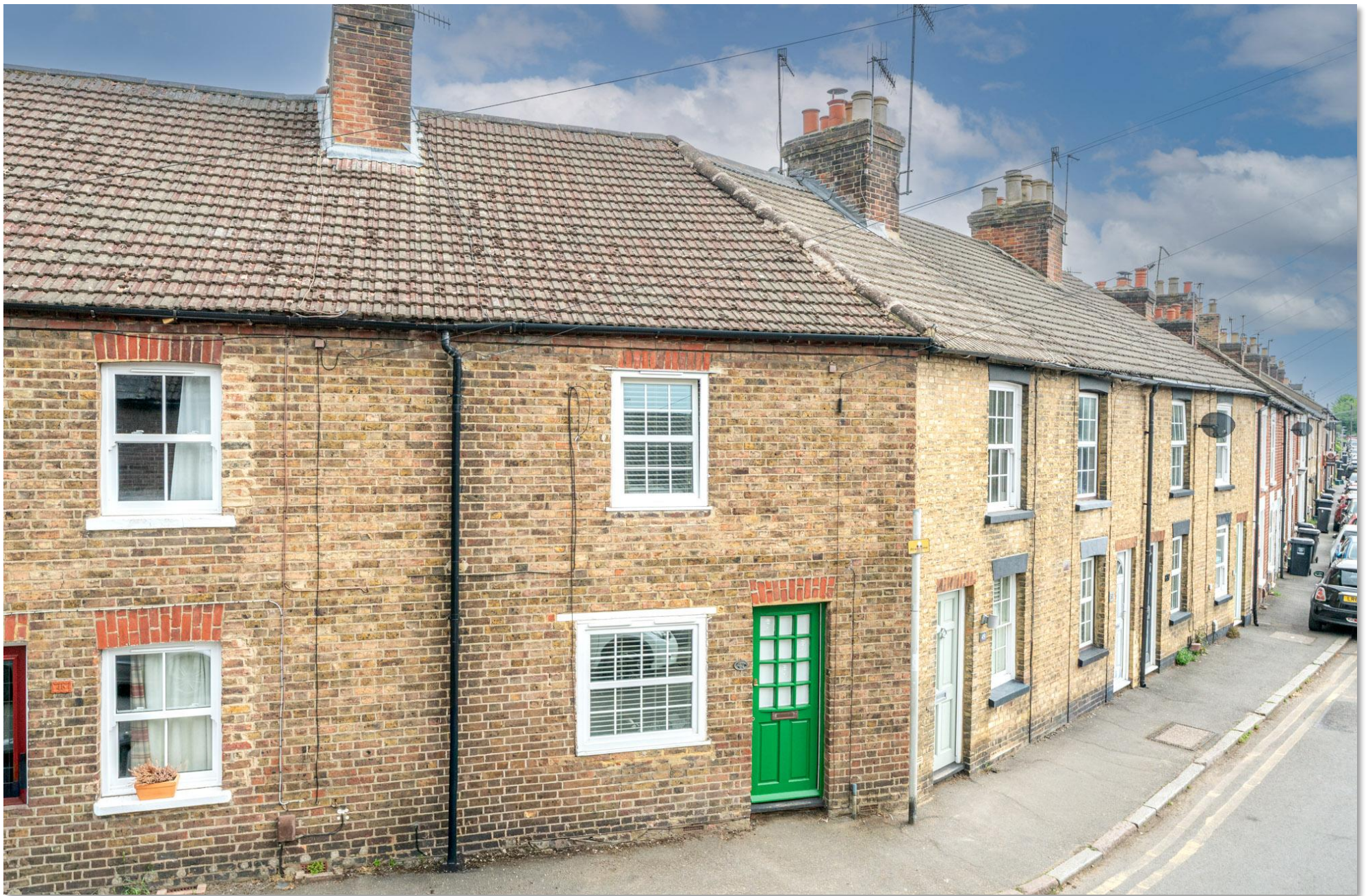
George Street, Berkhamsted HP4 2EG