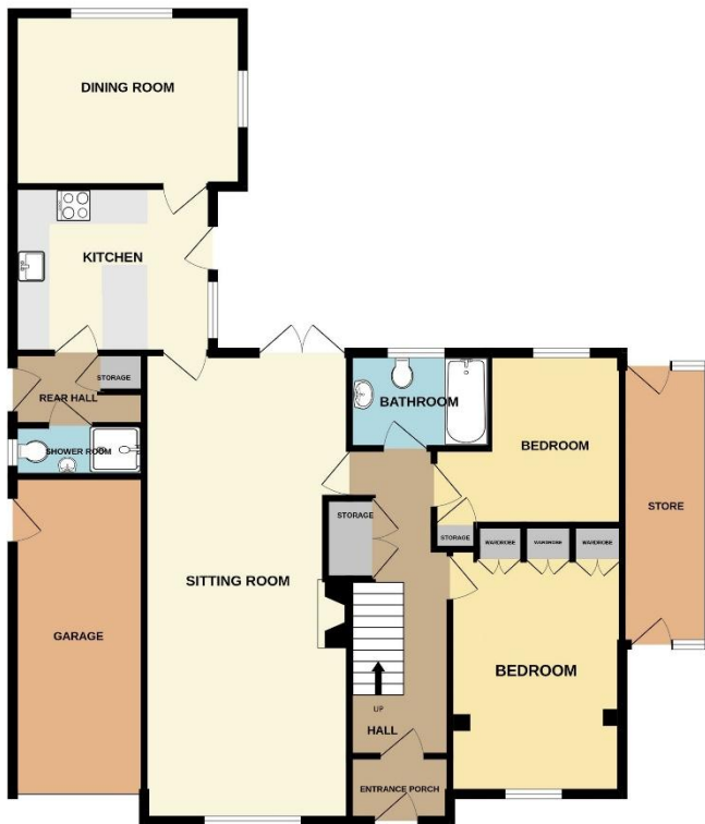
GROUND FLOOR 1261 sq.ft. (117.2 sq.m.) approx.

The EPC rating for this property is D (58)