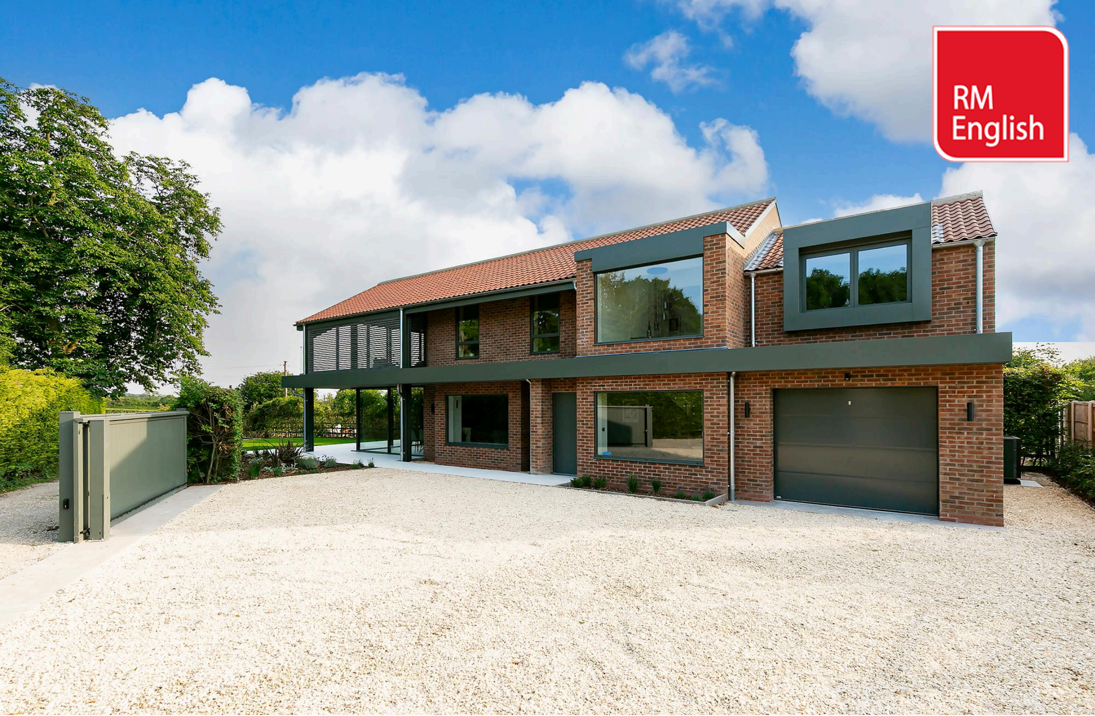
Park Lane, Bishop Wilton, York, YO42 1SW