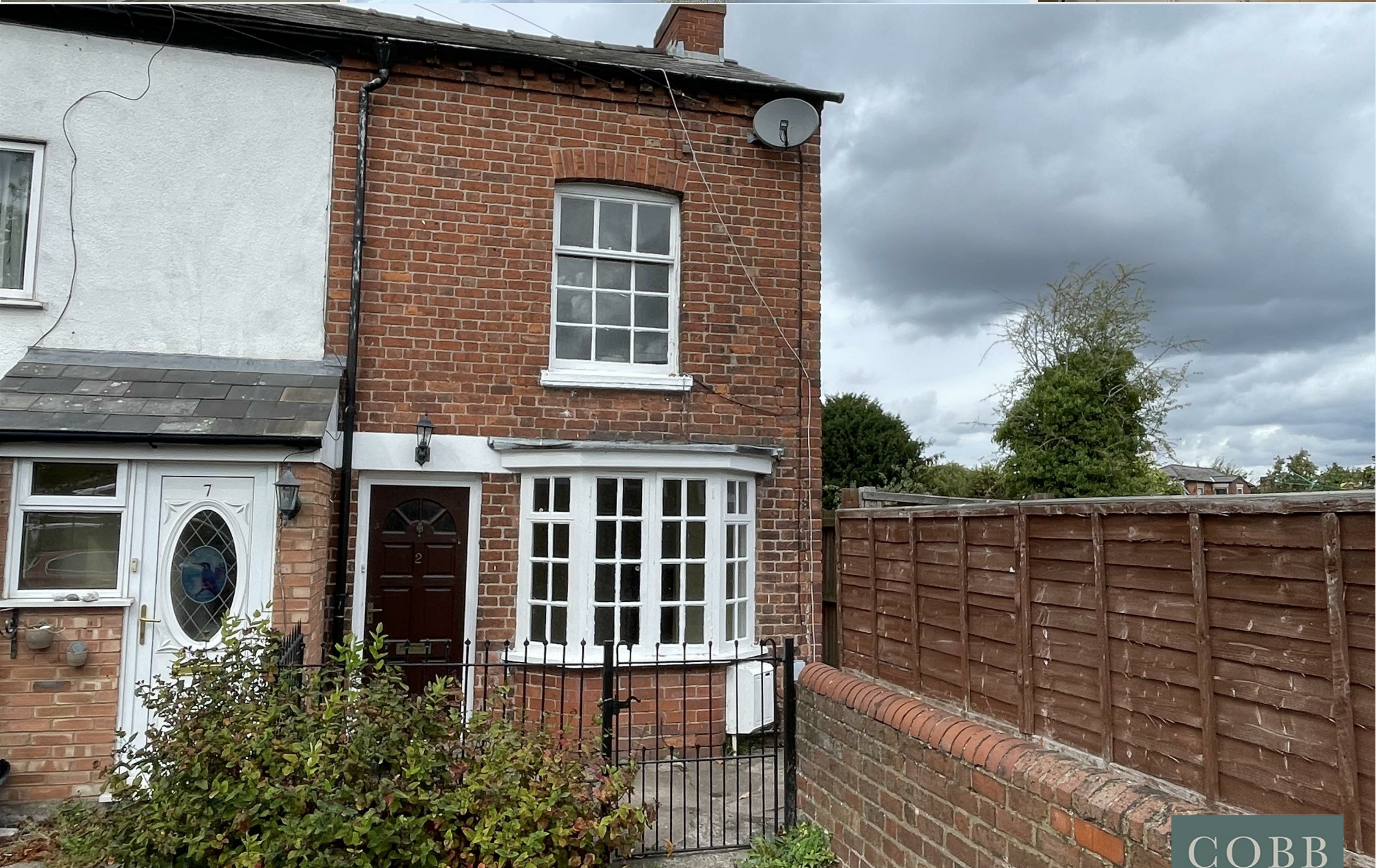
2, Priory Place, Hereford, HR4 9ND Offers Over £200,000