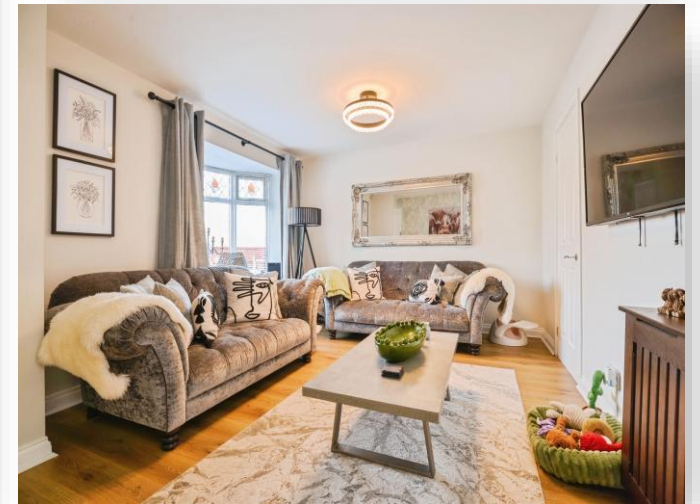
Midfield View, Stockton-On-Tees TS19 0TG