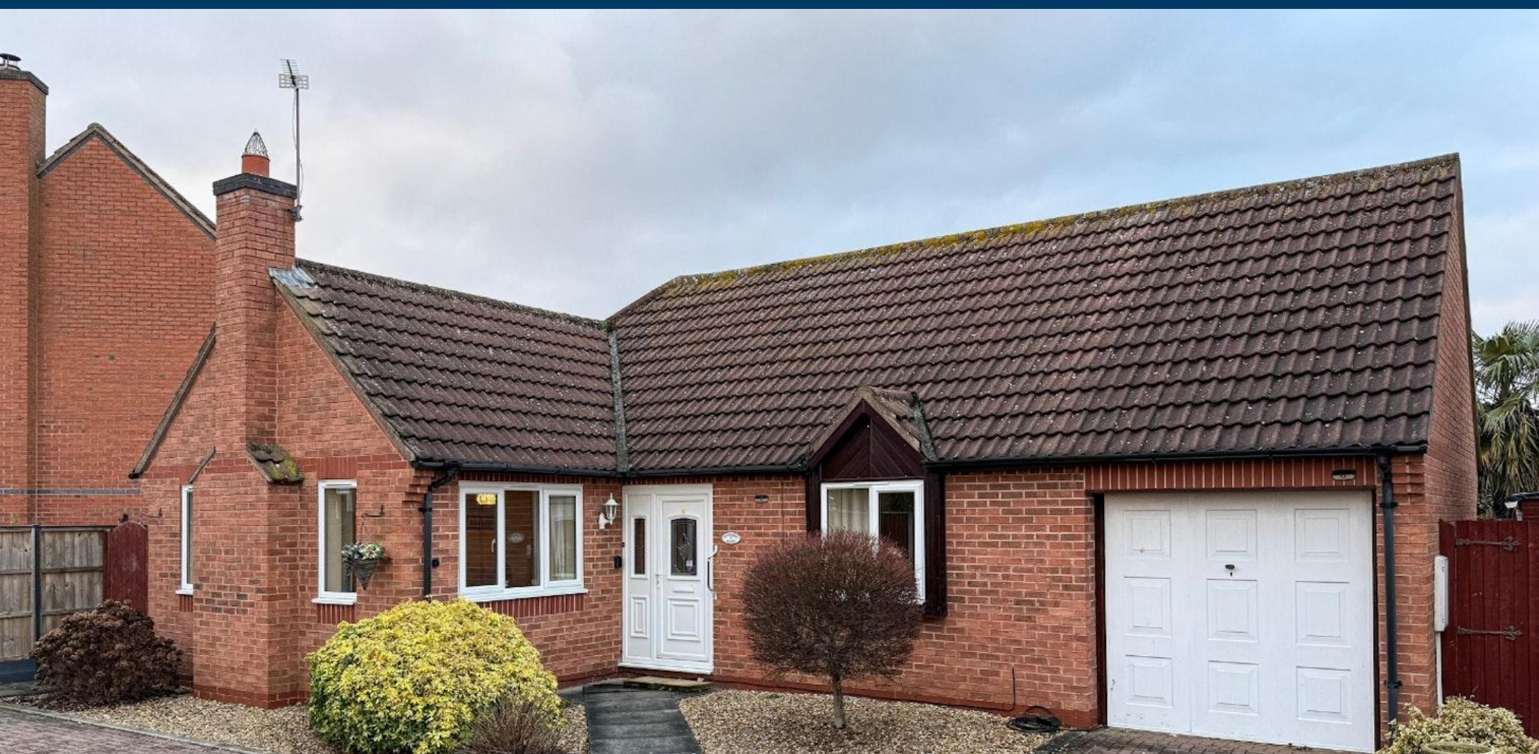
Marrison Court, Farndon