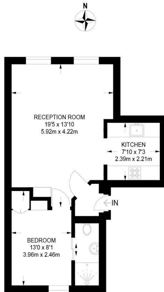
FIRST FLOOR 449 SQ FT / 41.7 SQ M