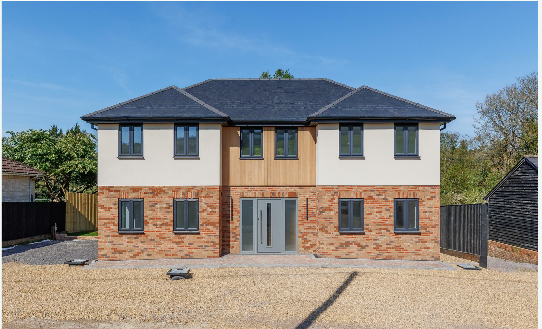
Oak Trees, Blackwater Road, Newport, Isle of Wight