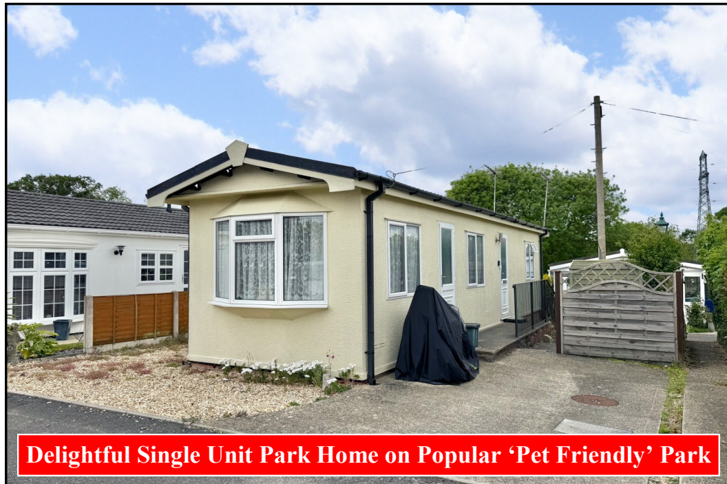
Delightful Single Unit Park Home on Popular 'Pet Friendly' Park

171 Central Drive, Oaktree Park, St Leonards, Ringwood. BH24 2RX