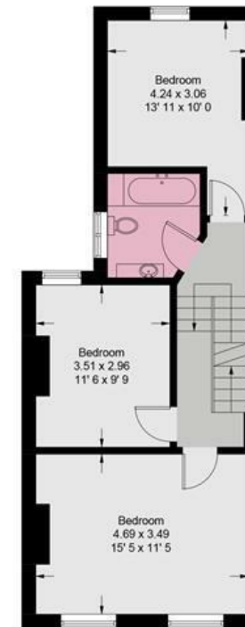
First Floor 538 sq ft / 50 sq m