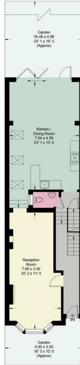
Ground Floor 787 sq ft / 73.1 sq m