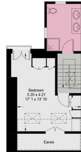
Second Floor 374 sq ft / 34.8 sq m (Including Reduced Headroom / Eaves)