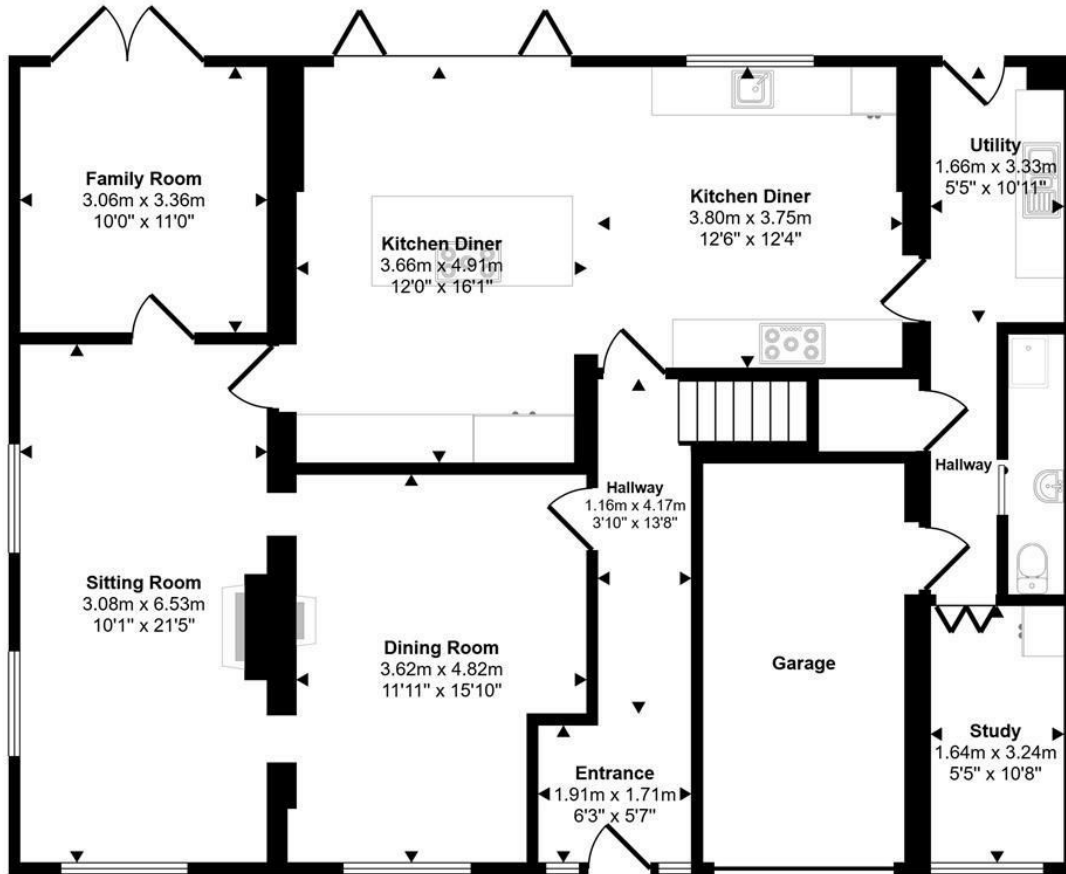
Ground Floor Approx 131 sq m / 1405 sq ft

Approx Gross Internal Area 215 sq m / 2318 sq ft