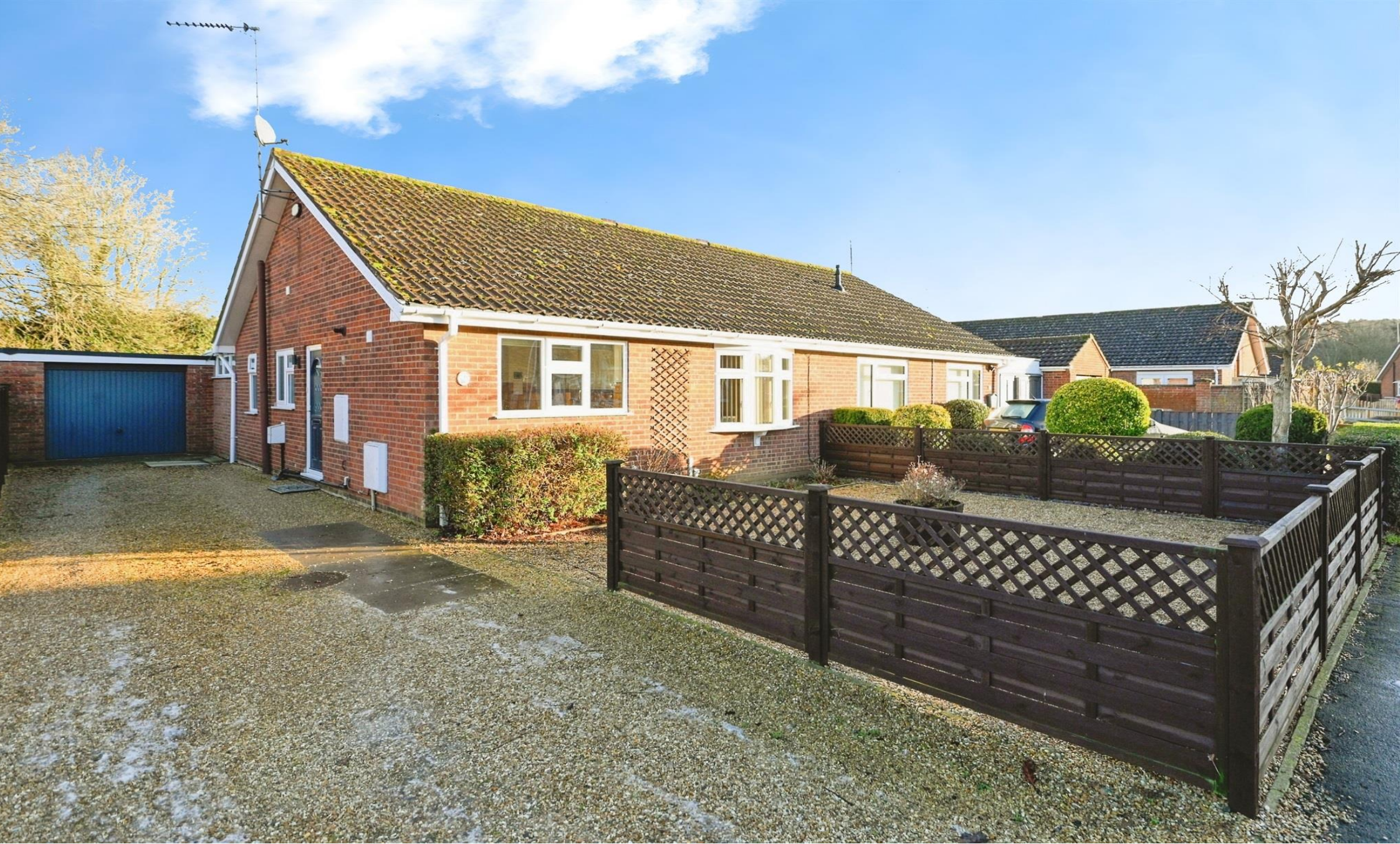
Burghley Road, South Wootton, King's Lynn, PE30 3TU