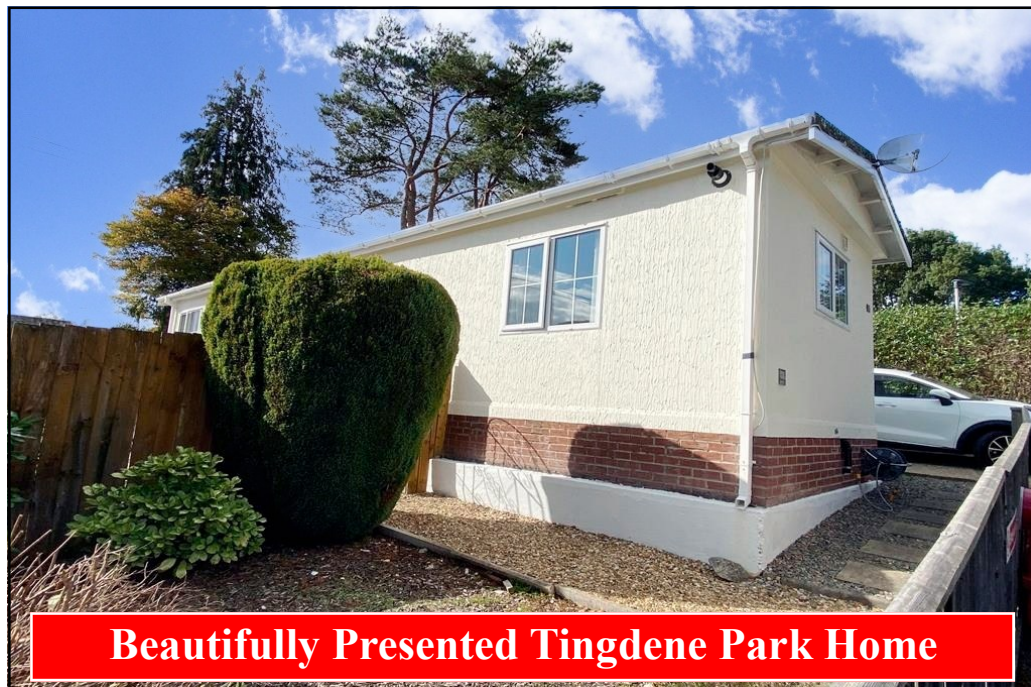
Beautifully Presented Tingdene Park Home

9 Sunnyside Park, Ringwood Road, St Ives. BH24 2NW