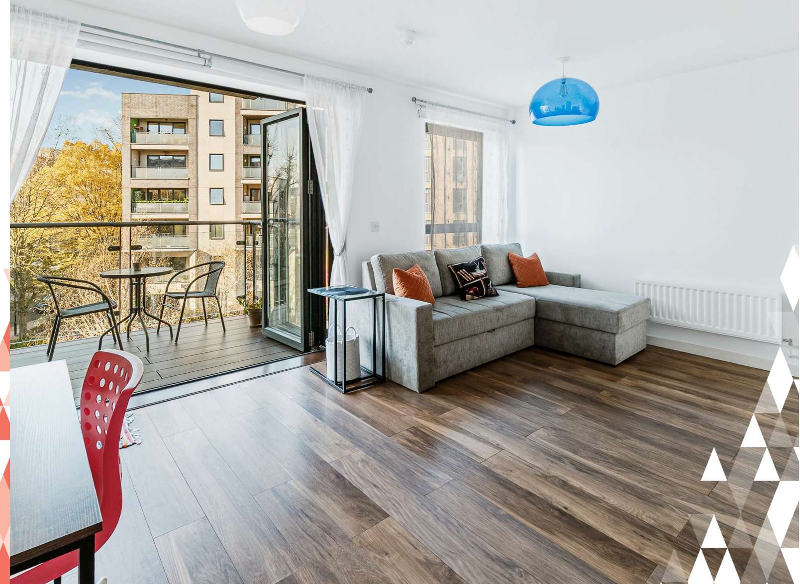
Chaplin House Approximate Gross Internal Area = 52.6 sq m / 566 sq ft