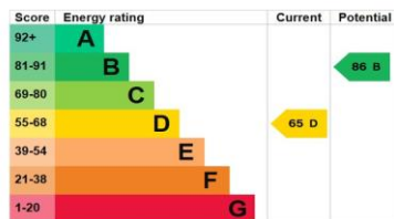
The graph shows this property's current and potential energy rating.