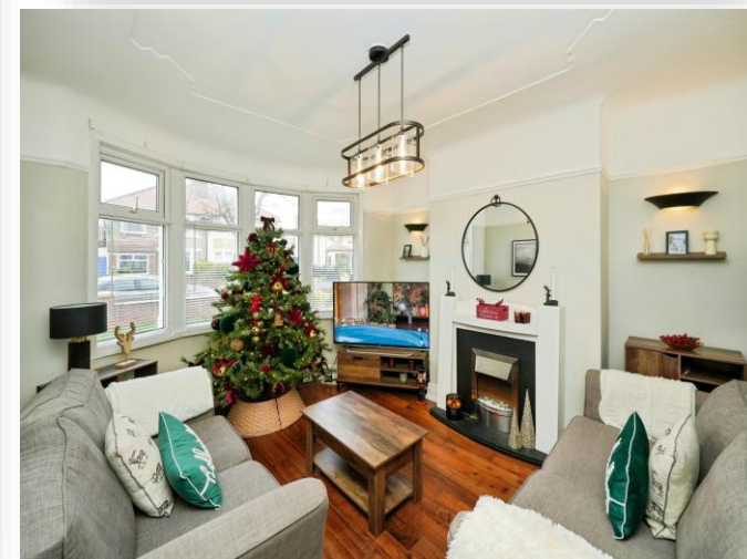
Eastway, Greasby Wirral CH49 2NT