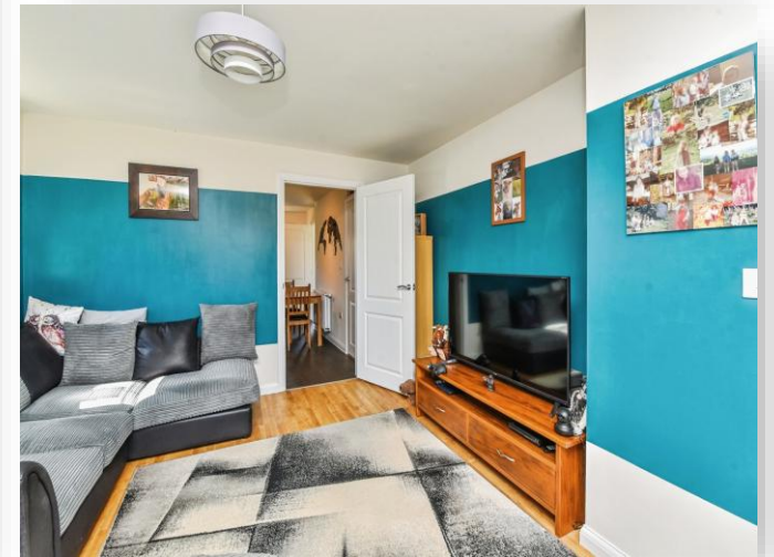
Slopers Lea, Devizes SN10 2GU