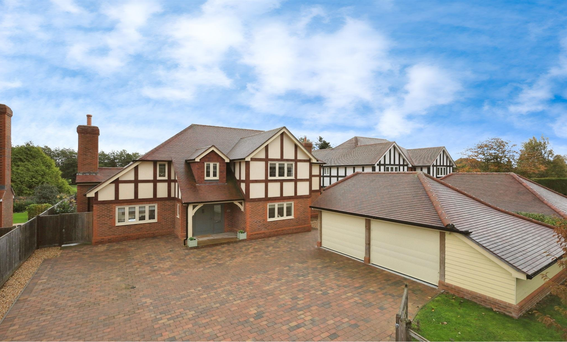
Danecroft Place, Hellingly, Hailsham BN27 4ES