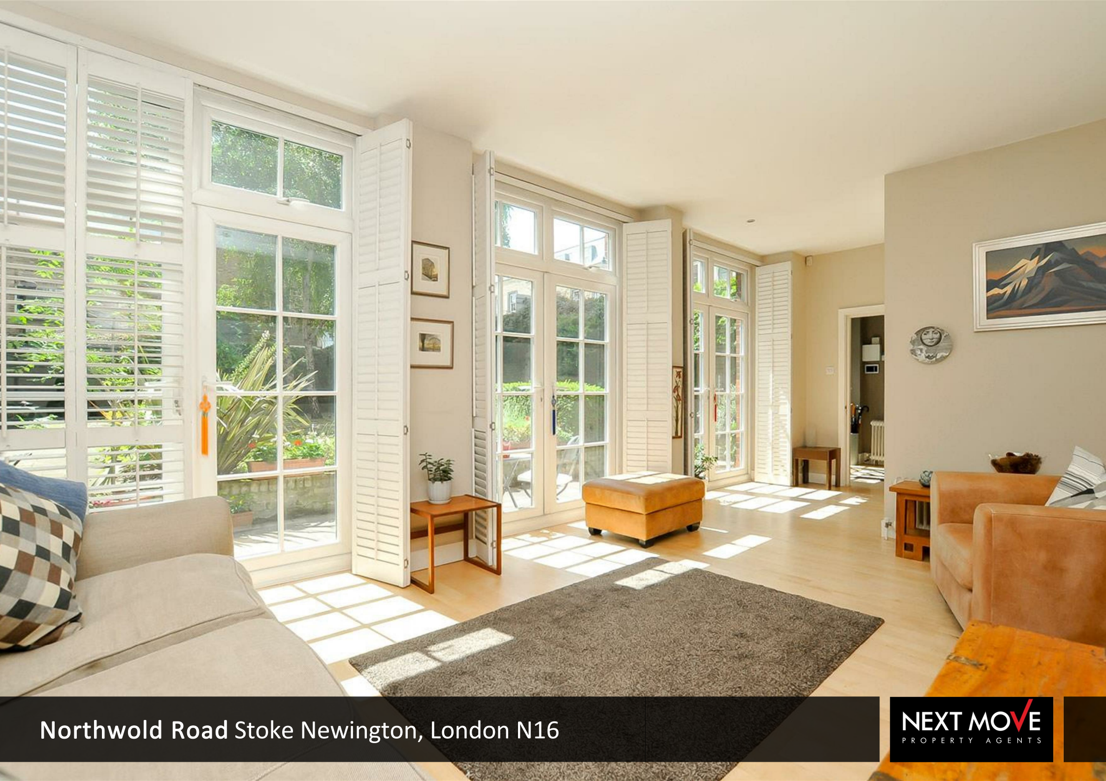
Northwold Road Stoke Newington, London N16