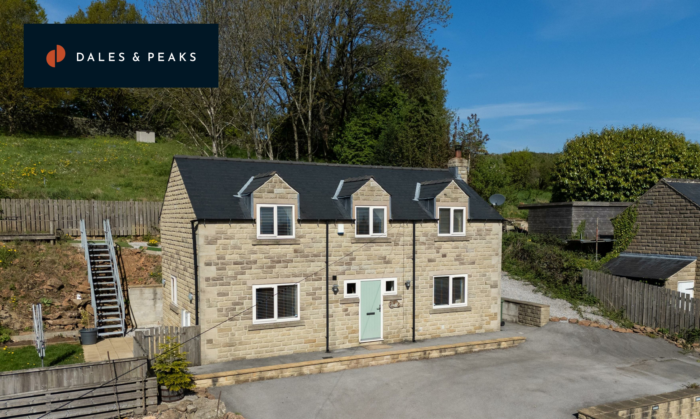
Catbells Ashover Road Ashover, Chesterfield, S45 0BL Asking Price £465,000