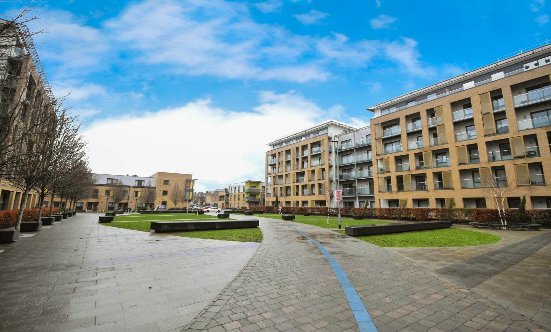
Cunard Square, CHELMSFORD CM1 1AU