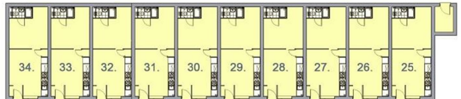
Kiln Court 25-34