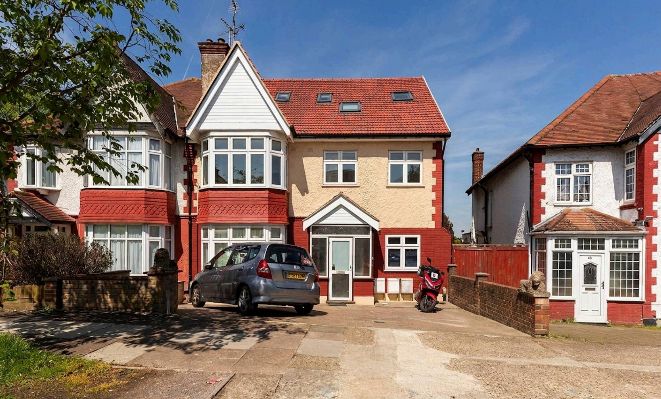
Park Chase, Wembley, HA8 £1,950 pcm