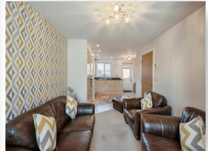
Comrades Place, Goldthorpe Rotherham S63 9GN