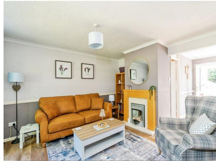
Farnhurst Road, Barnham BOGNOR REGIS PO22 0JN