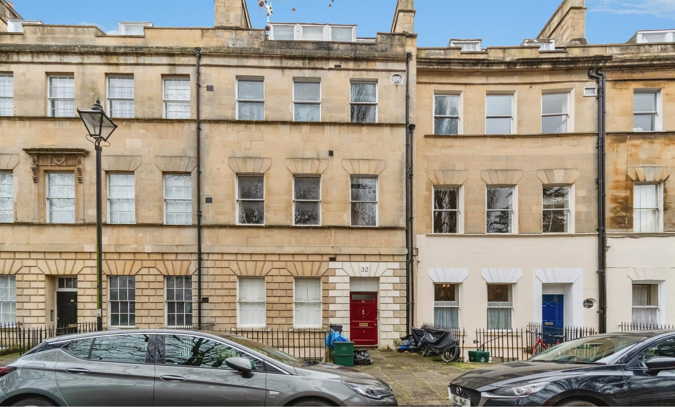
Grosvenor Place, Bath, BA1 6BA