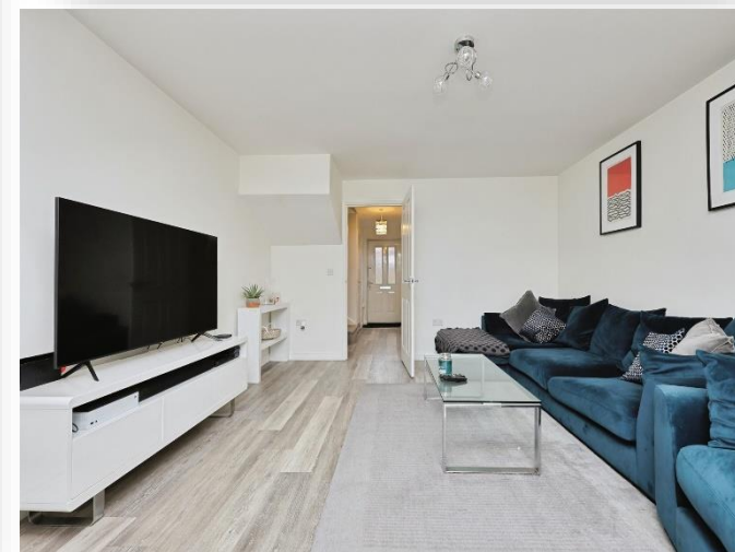
Grebe Drive, Sprowston, Norwich, NR7 8FJ