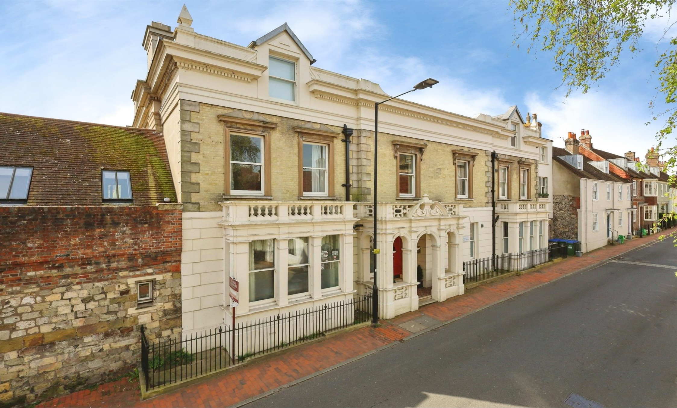
Southover Manor House Southover High Street, LEWES BN7 1HT