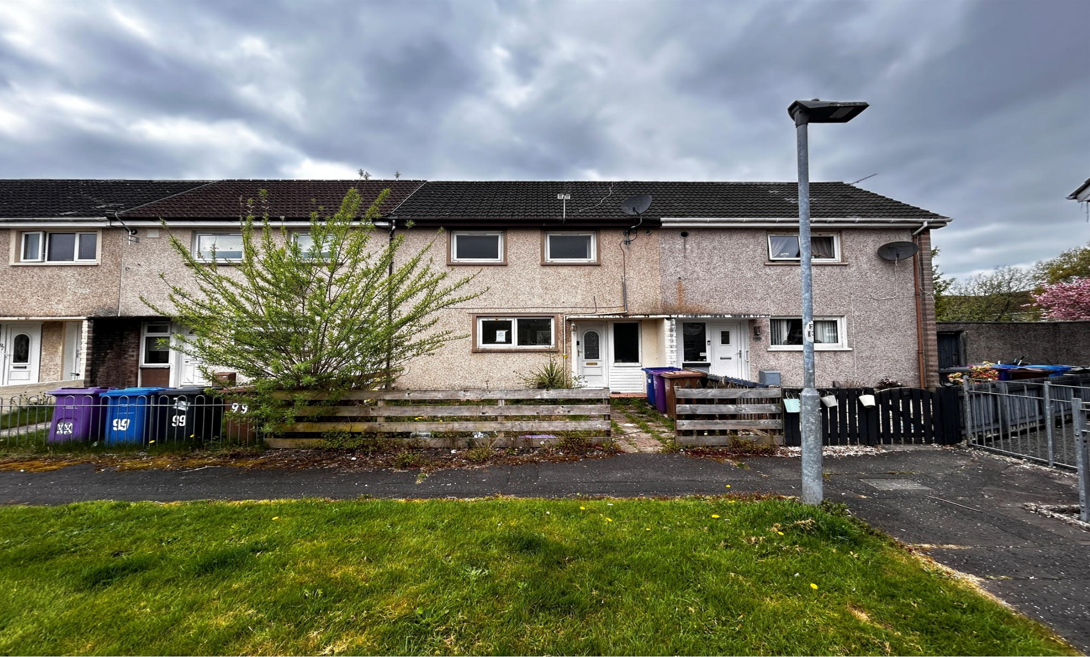
Bilby Terrace, Irvine KA12 9DS