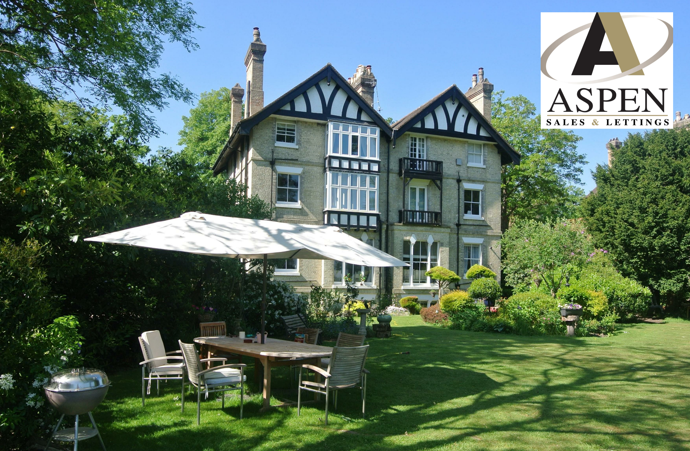
Richardson House Coopers Hill Lane, Englefield Green, TW20 0JY