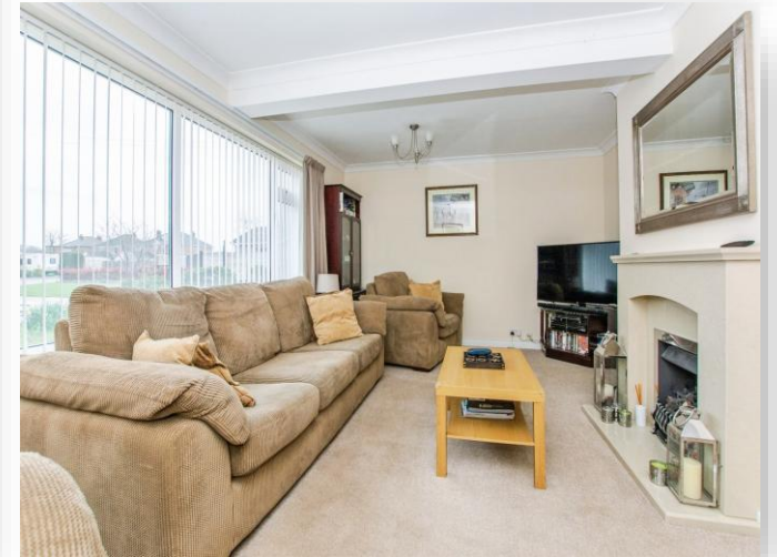
Milton Drive, Leverington Wisbech PE13 5DF