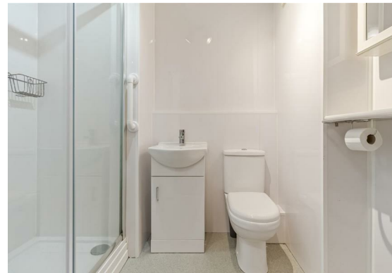
Shower room 7'4 x 5'3 (2.24m x 1.60m)