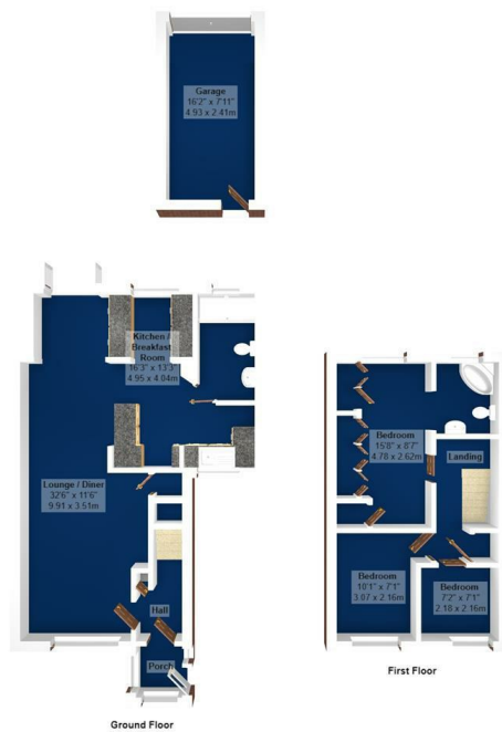
Total Area: 1076 ft 2 / 99.9 m 2 (Includes Garage) Whilst every attempt has been made to ensure the accuracy of the floor plan contained here, measurements are approximate and no responsibility is taken for error, omission or mis-statement. This plan is for illustrative purposes only and should be used as such by any prospective purchaser. Created by Jen 2024