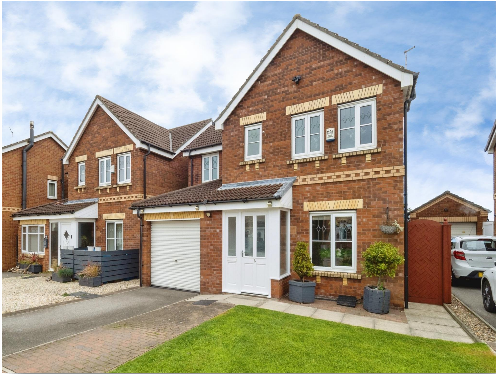
Braid Hills Drive, Bransholme, Hull, HU7 4ZN