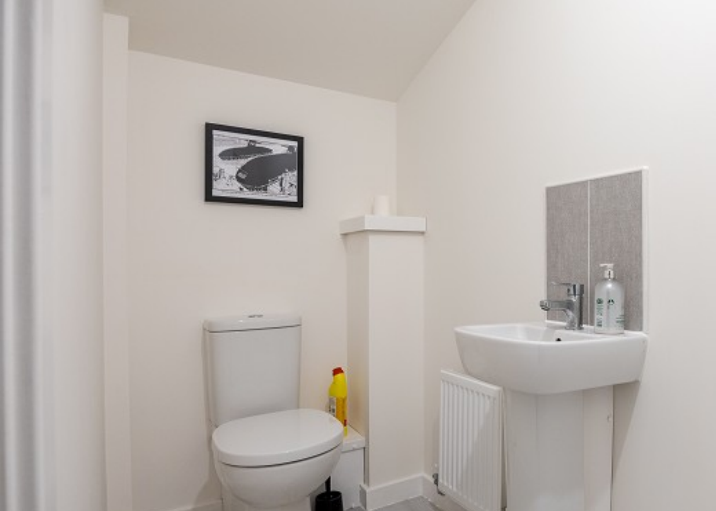
7 Anderson Court, Helensburgh. G84 8FD