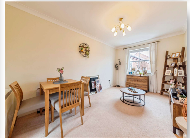
Warwick Court, Balderton Newark NG24 3SU