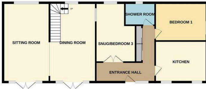
GROUND FLOOR 995 sq.ft. (92.4 sq.m.) approx.