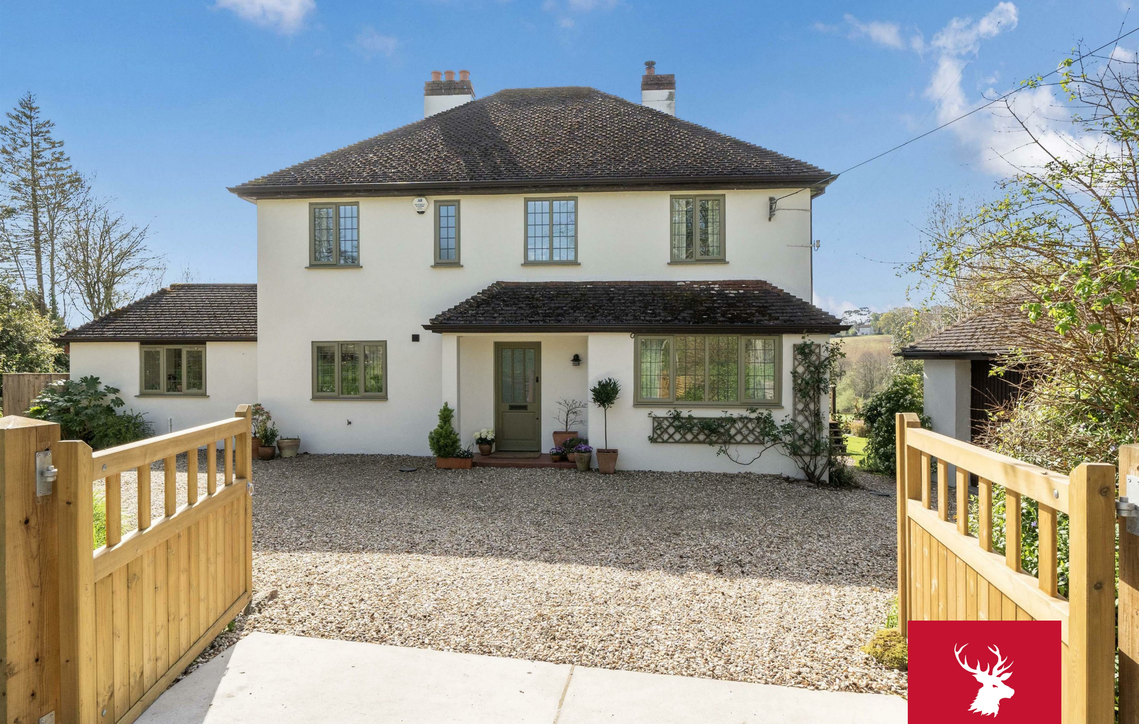
Marlow Holyford Lane