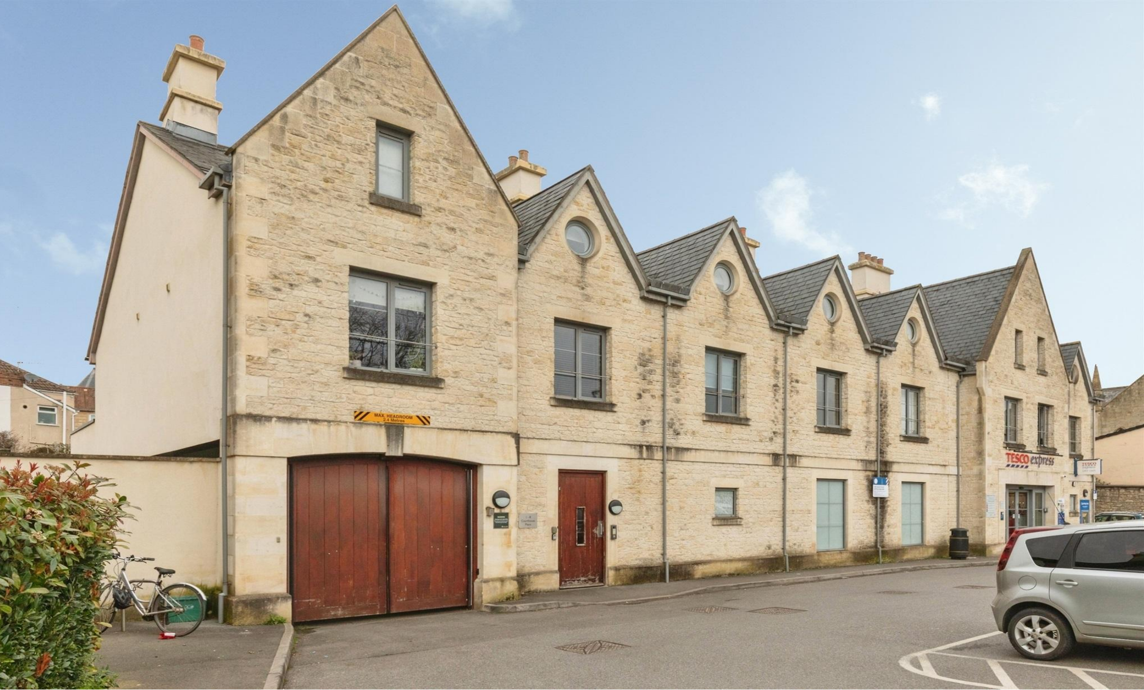
Courthouse Place, Bath BA1 3DE