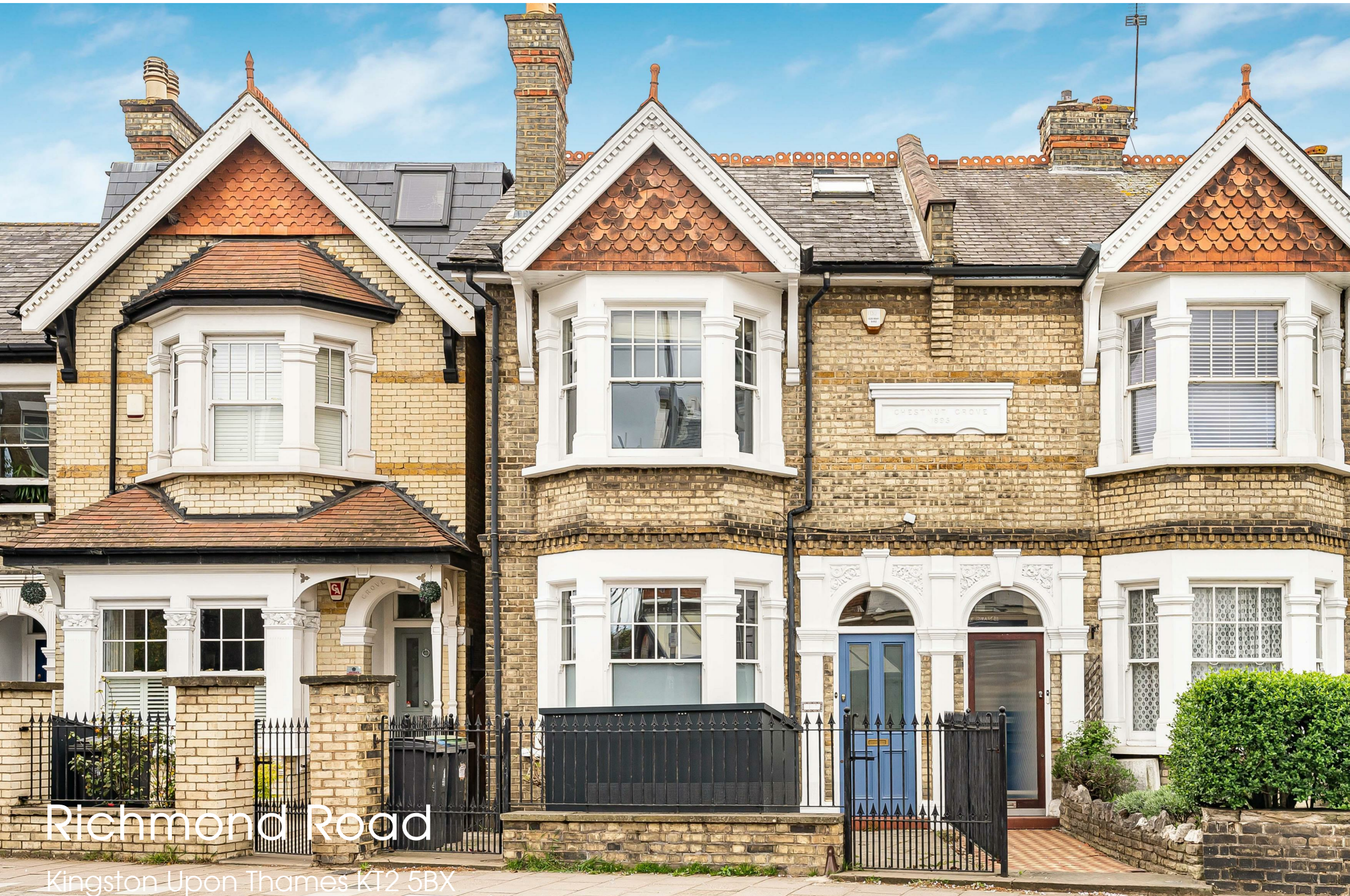
Richmond Road Kingston Upon Thames K12 5BX

Approximate Gross Internal Area 2047 sq ft - 190 sq m (Excluding Eaves Storage) Cellar Area 200 sq ft - 19 sq m Ground Floor Area 832 sq ft - 77 sq m First Floor Area 710 sq ft - 66 sq m Second Floor Area 305 sq ft - 28 sq m