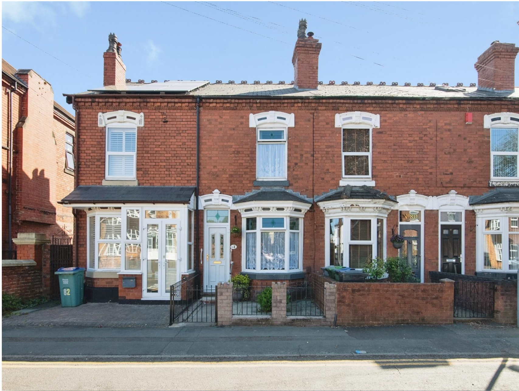
Brunswick Park Road, Wednesbury WS10 9QR