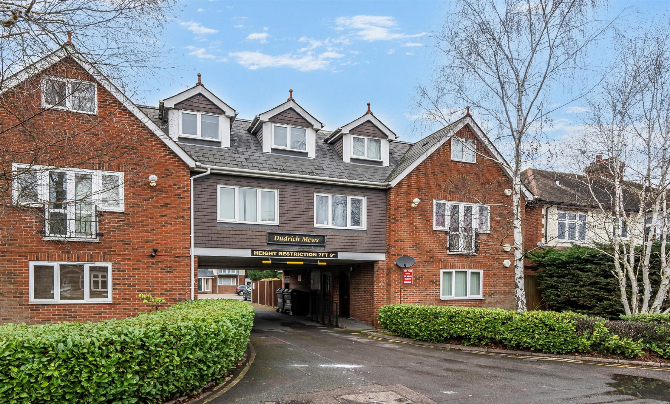
Dudrich Mews, Enfield, EN2 8FR