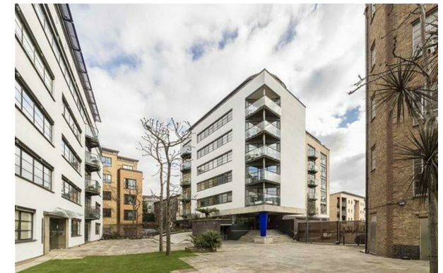
Penthouse Apartment, New Wharf Road, London N1 9RW £3,150 Per Month