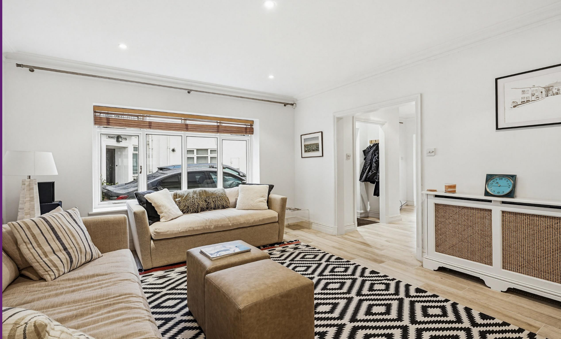
Campden House Close London, W8