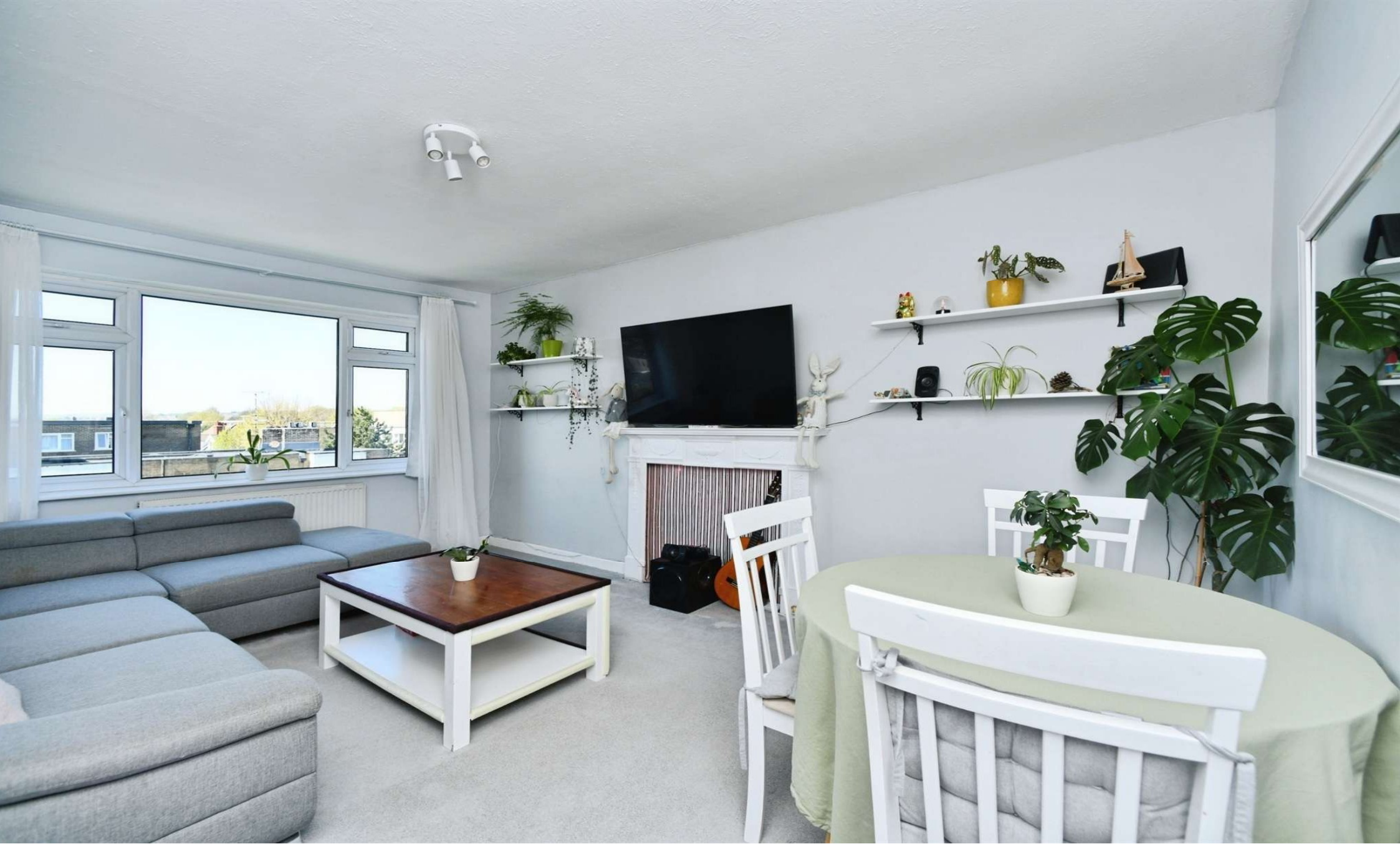
Janeston Court Wilbury Crescent, Hove BN3 6FT